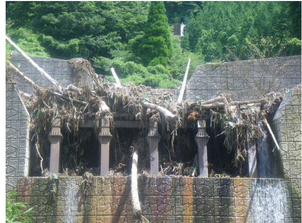
(a) Before woody debris removal

After debris removal was completed at the Shioi river, Hebonoki river, Koga Fall, and Yoroizuka river dams, an investigation was once again conducted to determine the soundness of the steel structures of these dams in February 2013. The investigation was done to determine the following items: (1) overall and local deformation of steel members, (2) looseness of bolts, and (3) corrosion and abrasion. The results of the investigation confirmed the soundness of all these dams. On this occasion, all the dams had their openings blocked by woody debris, which is presumed to have played the role of a buffer. No deformation or indentation was confirmed on the steel members. In addition, the paint coat on the steel members was almost intact, and no abrasion was confirmed (refer to Photos 7 and 8 ).