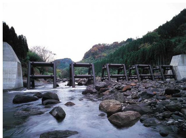
Photo 11 Conservation of mountain stream environment (Sanbonmatsu dam)

Photo 11 shows a case where a steel open-type Sabo dam has been installed. The foundation of the steel open-type Sabo dam is installed in line with