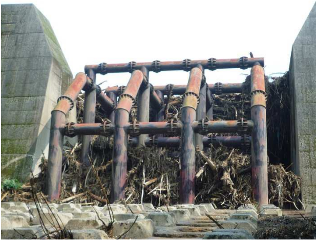
(a) The situation of open part