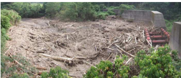
(b) The situation of upper stream