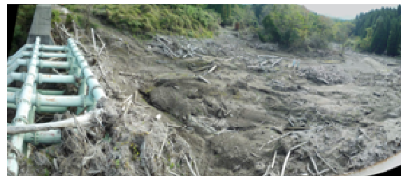
(b) The situation of upper stream