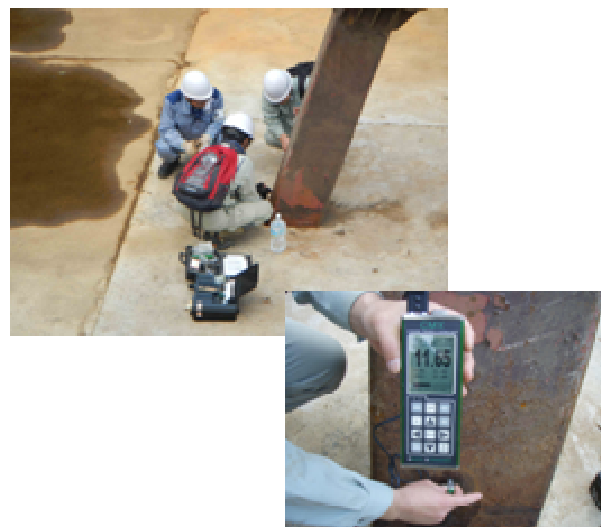
Photo 8 Investigation of soundness