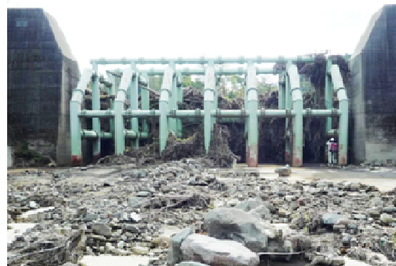
(a) The situation of open part

main dams( Table 1 ). From downstream to upstream, these are known as the Furue river No. 9, Furue river No. 2 (8m high steel structures in both cases), and Furue river No. 11 dams (4.5m height). The three dams were almost fully heaped up, with their openings blocked by woody debris and shrubs accompanied by sediment comprising primarily fine sand that was captured almost up to the top (refer to Photos 5 and 6 ). Damage resulting from sediment floods involving woody debris that reached the vicinity of National Road No. 57 occurred during the disaster of 1990, but no floods occurred downstream by the effects of these dams at this time(refer to Fig. 2 ).