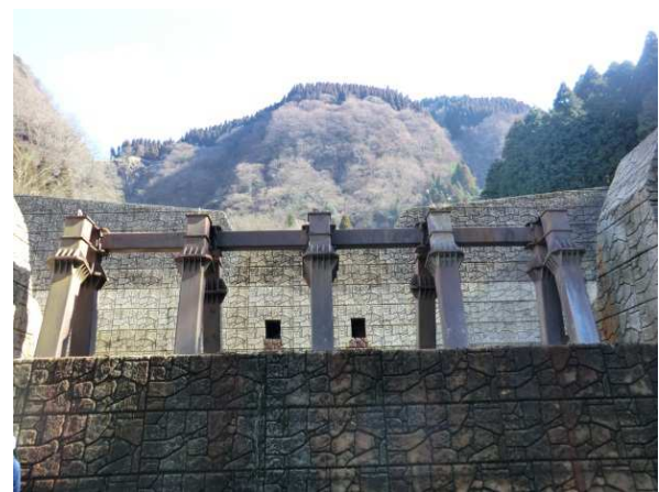
(b) After woody debris removal